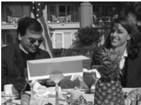
Florida Supreme Court Justice Raoul Cantero (L) visits with Conference President Judge Beth Bloom (Miami-Dade).