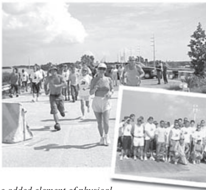
Monroe County Judge Ruth Becker-Painter, a seasoned, long-distance runner the past 28 years, has incorporated her passion for the sport into creative sentencing in Drug Court.

"There is a party atmosphere and an economy which caters to drugs and alcohol consumption in the Keys," Judge Becker-Painter said. "The exercise gives them some kind of activity to get away from the bars, and hopefully to release some endorphins, a natural way to feel good. Endorphins, unlike some other brain chemicals, are not suppressed by chronic drug abuse."