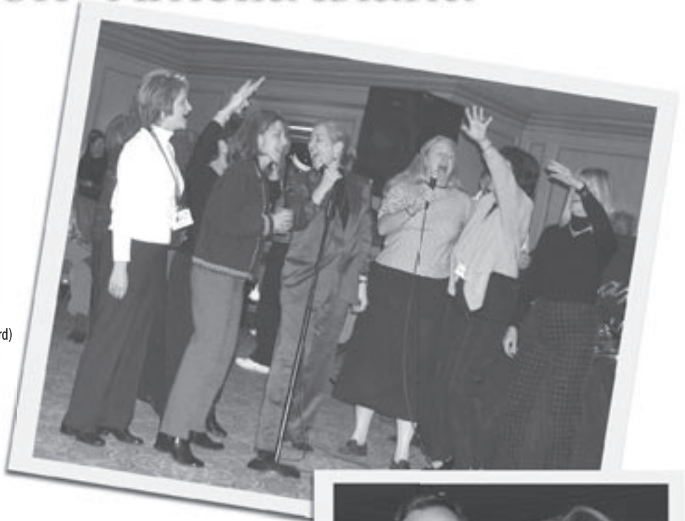
Judges sing Lucy in the Sky at karaoke night